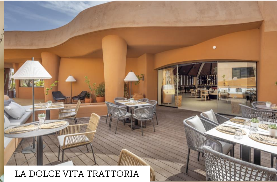
LA DOLCE VITA TRATTORIA