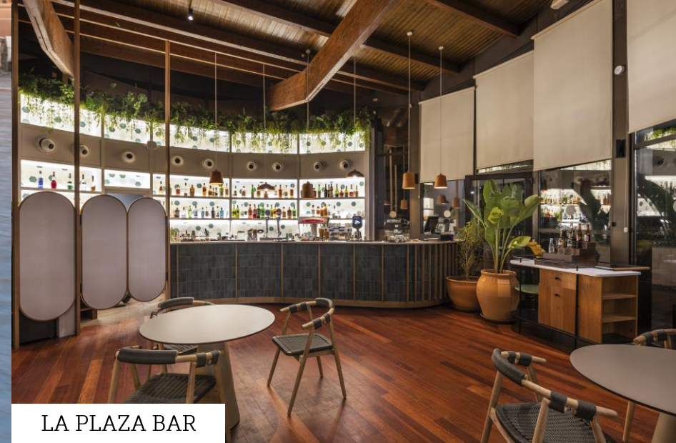
LA PLAZA BAR