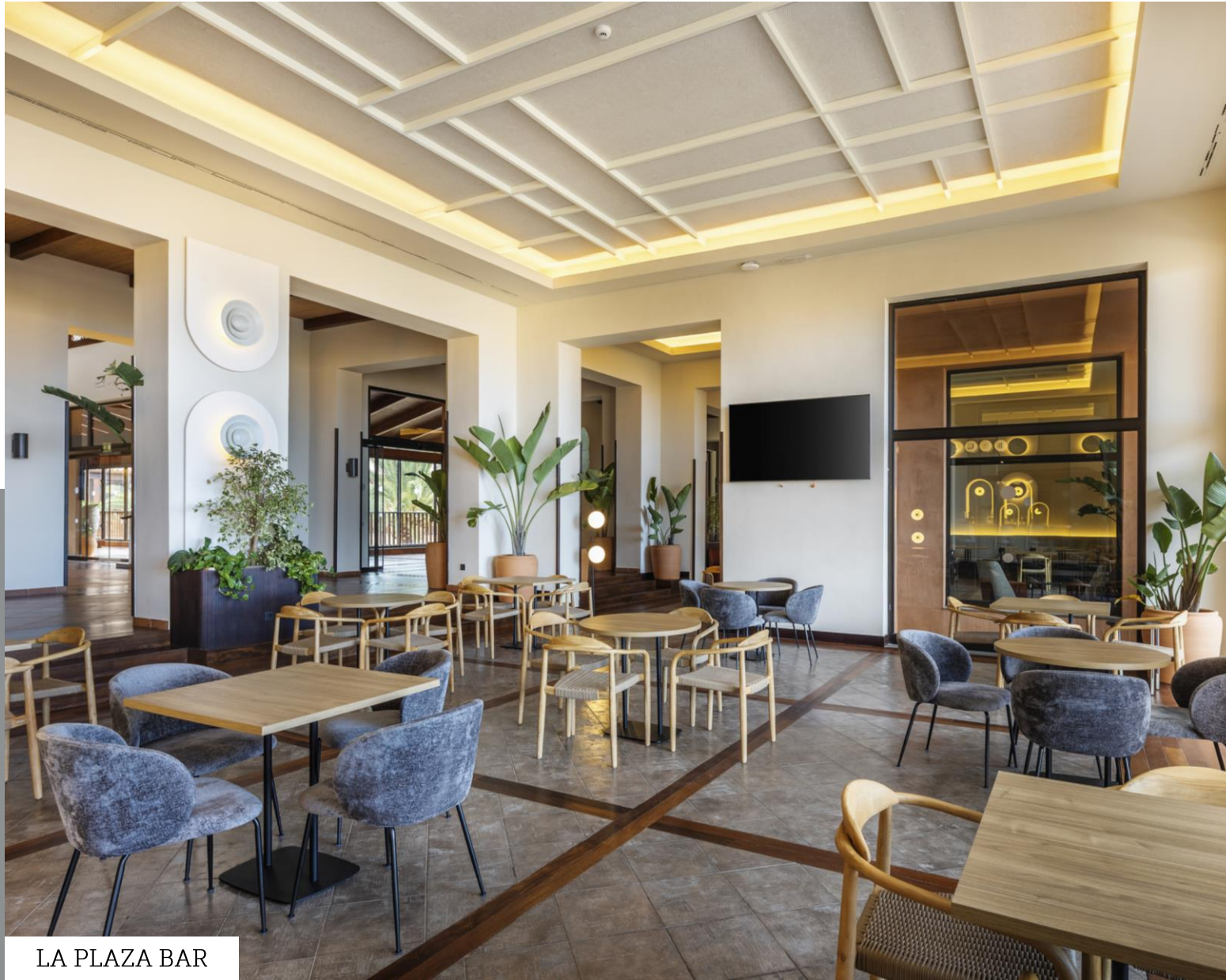
LA PLAZA BAR