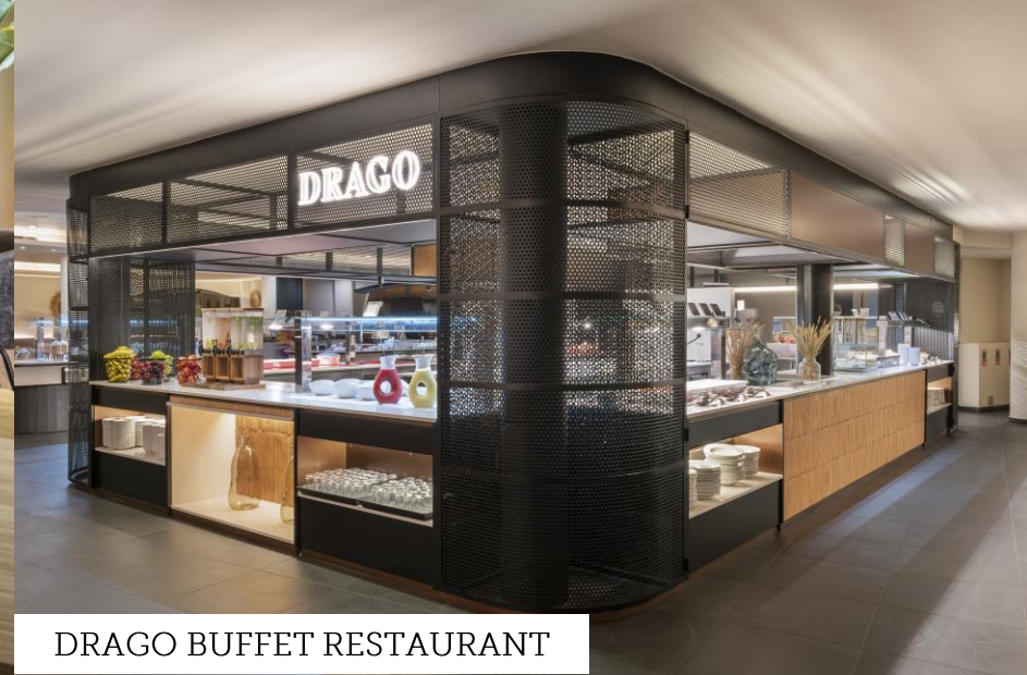
DRAGO BUFFET RESTAURANT