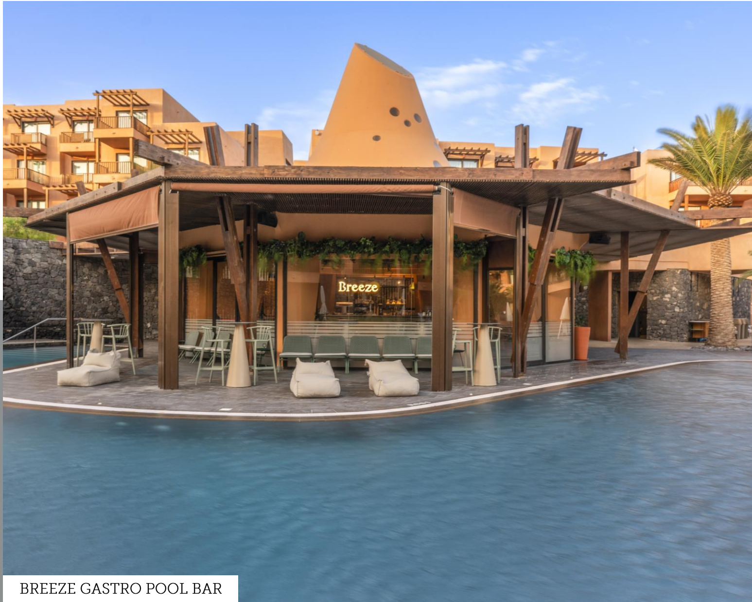
BREEZE GASTRO POOL BAR