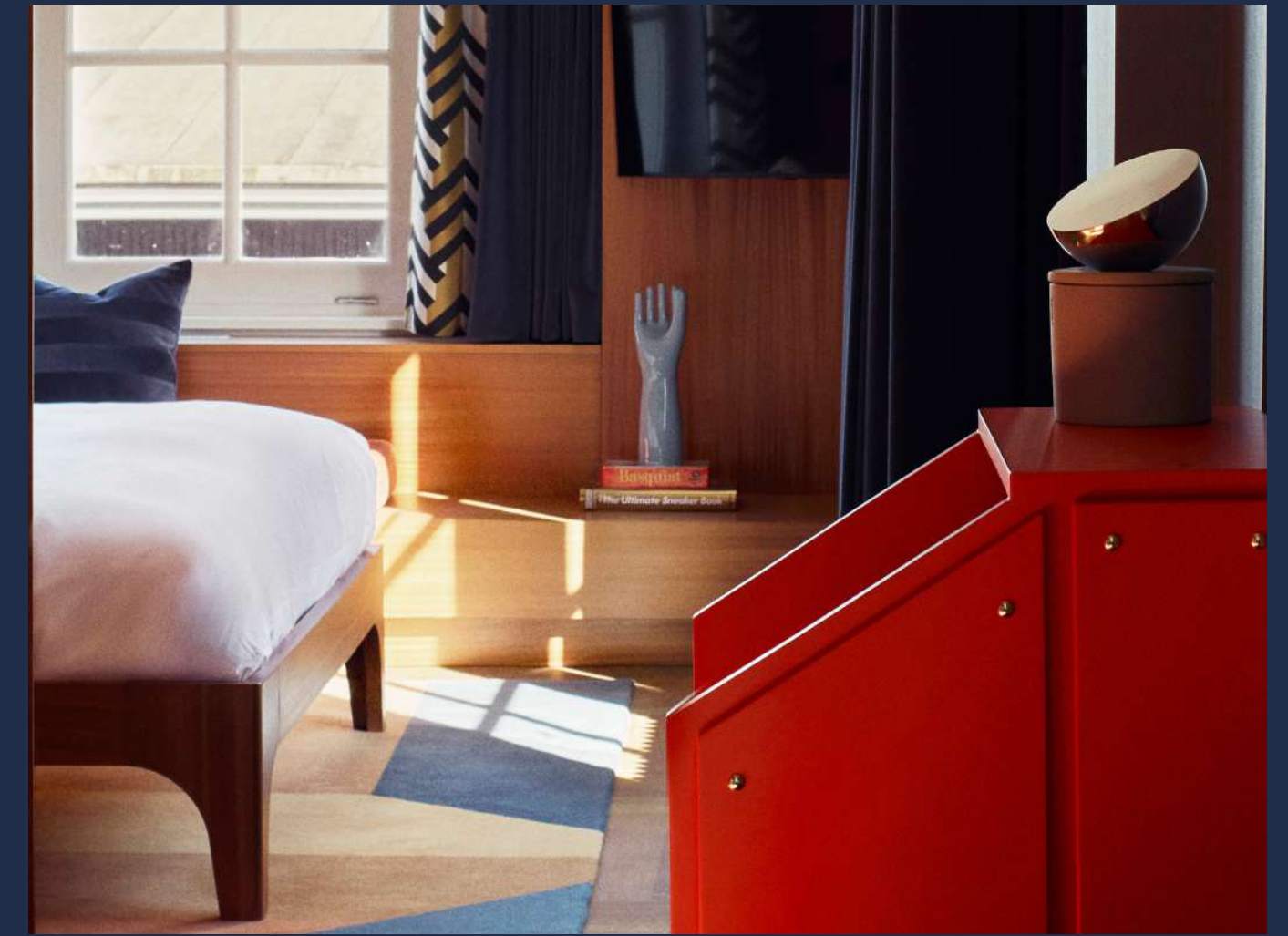
Concept Room: Tower

A unique wood-paneled suite, the Sauna Room comes with a dining area, antique rugs and a neon-green bathroom. Bean bags, a huge TV and a state-of-the-art five-person bed is all part of the experience, too. Hello, party.