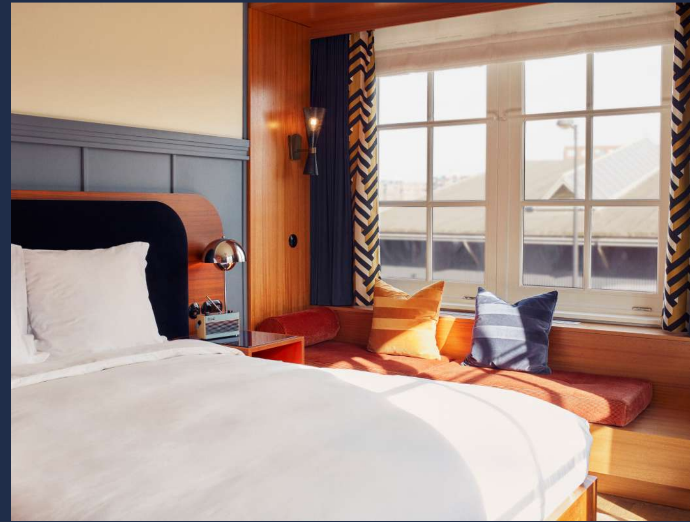
Concept Room: Gather

Hit all the high notes with our gorgeously appointed Music room, complete with a grand piano for all you artistes; whether budding performer or seasoned virtuoso. This decadent space for four is spread across two levels connected by a statement spiral staircase, and with a separate living area for live piano sessions.