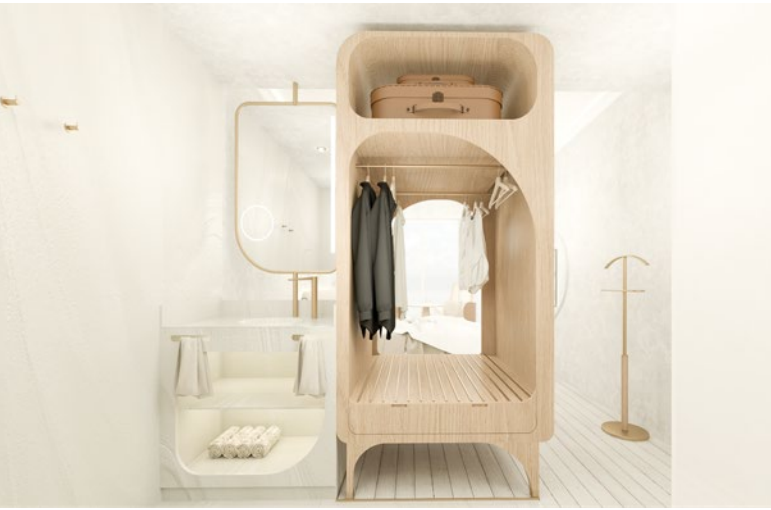
_ ROOM & WC