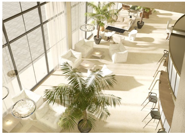
_ LOBBY / BAR