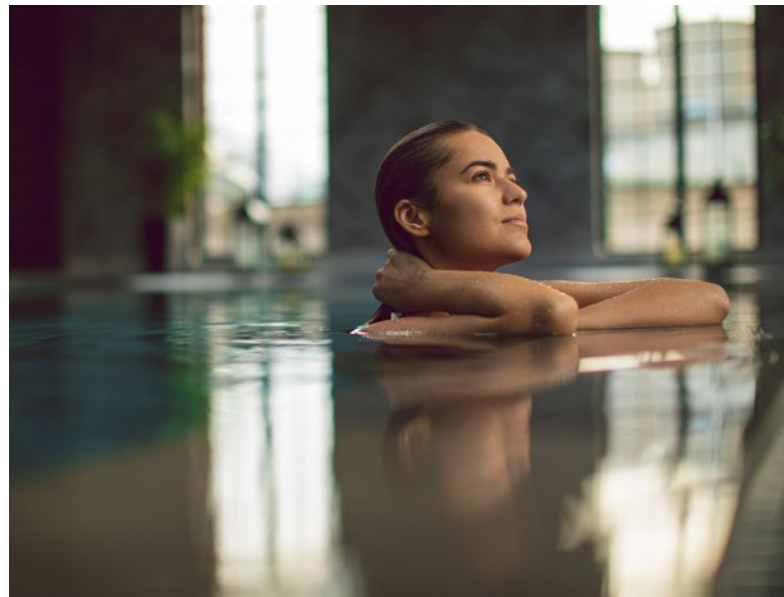
_ SWIMMING POOL