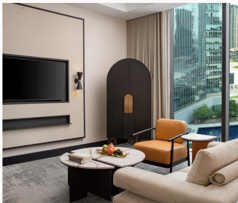
Deluxe Pool View Room