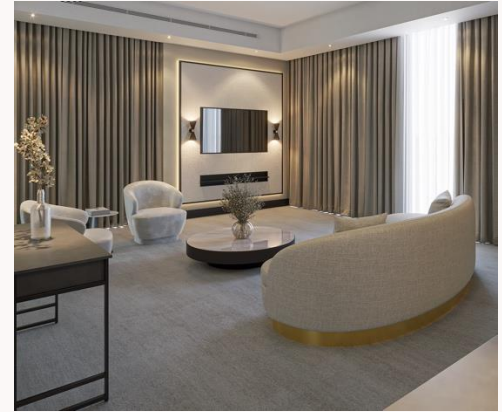
Anantara Royal Suite with Pool