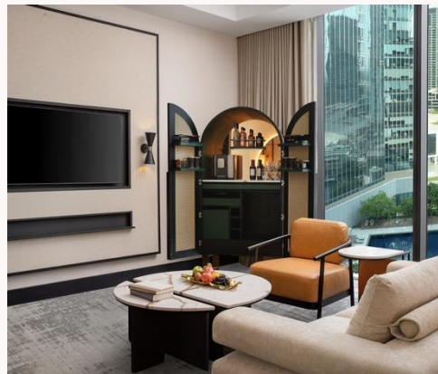
Superior Pool View Room