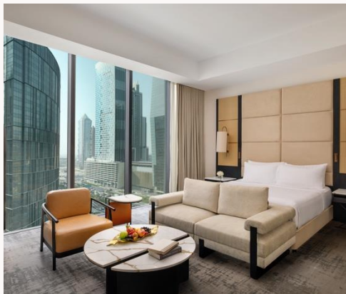
Superior City View Room