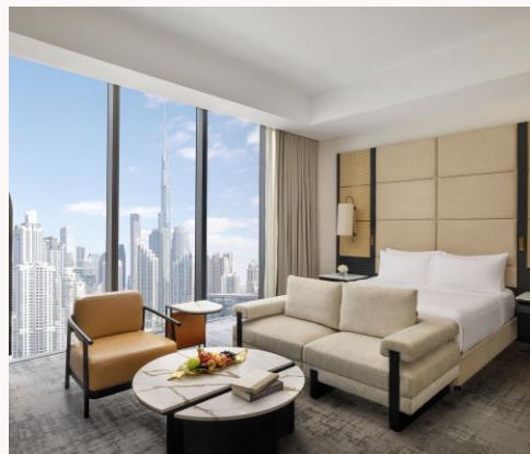
Luxury Burj Khalifa View Room