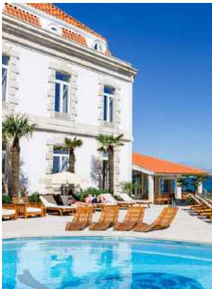
MAIN BUILDING (Duke of Loulé Palace)

Acquired in 1982, revamped and enlarged during 18 months. Duke of Loule Palace, also known as “the box of almonds”, was built in 1873 and was home to several royal families.