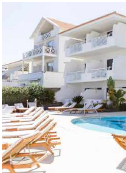
THE WHITE HOUSE BUILDING Linked to the main building by an indoor passageway.

Acquired in 1982, revamped and enlarged during 18 months. Duke of Loule Palace, also known as “the box of almonds”, was built in 1873 and was home to several royal families.