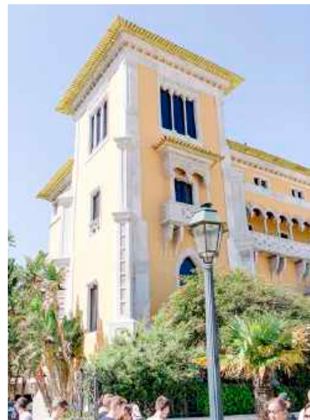
THE ALBATROZ PALACE (House of D. António of Lancaster)

Bought in 2004 and inaugurated in 2005, the White House maintains its old facade. The natural solarium and garden were enlarged to provide even wider panoramic views. The penthouse duplex suite has the most embracing view.