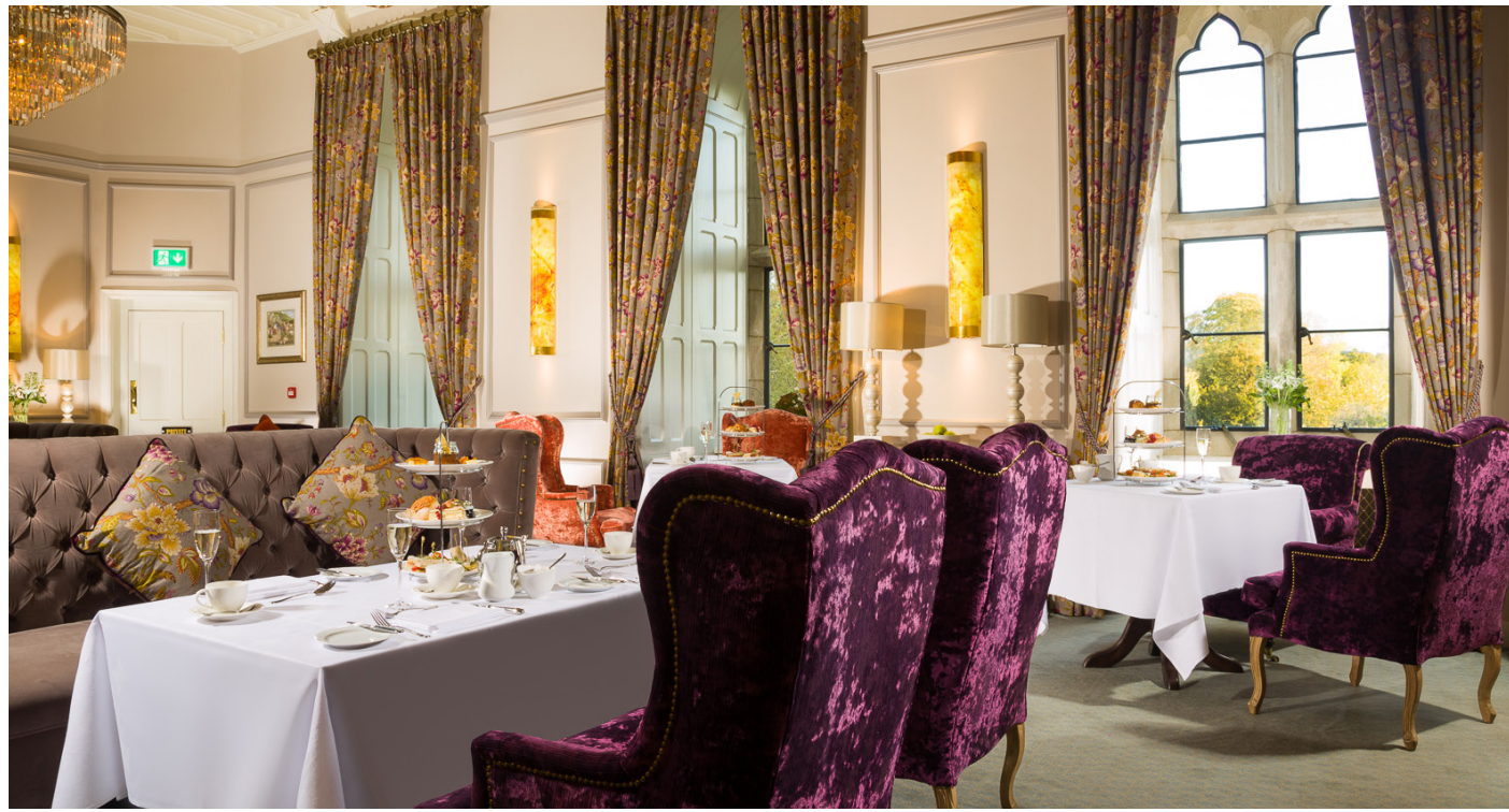
The Drawing Room

We offer a wide selection of specialty teas, delicate finger sandwiches, warm homemade scones and chilled bubbly. This is the perfect way to treat yourself, family and friends in luxurious and historical surroundings. The Drawing Room boasts some of the best views from inside the Castle.