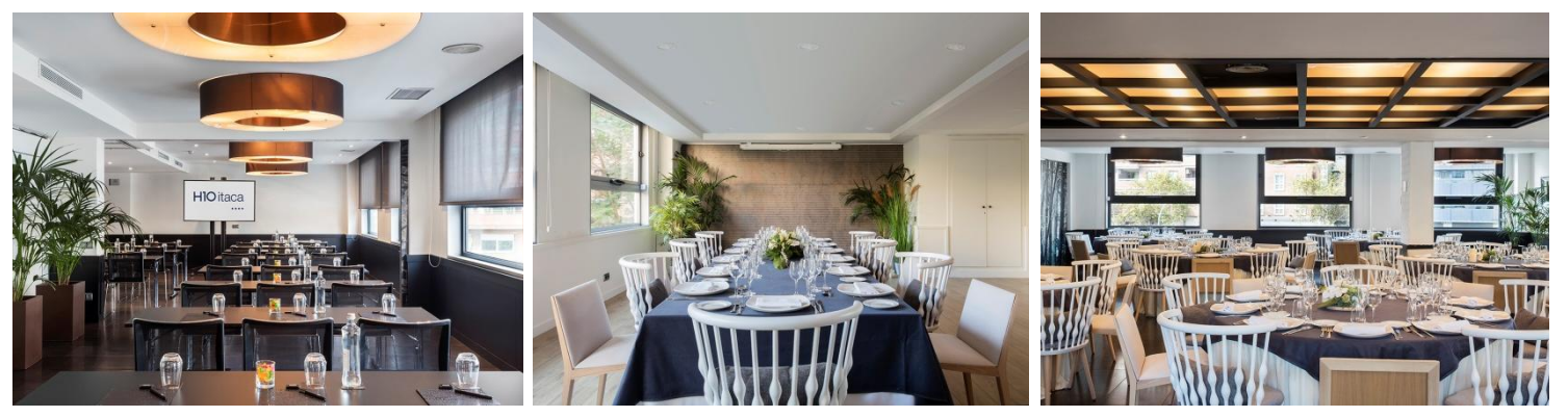
DALÍ – CLASSROOM LAYOUT

* Maximum capacity (optimal) recommended for these rooms by event type.