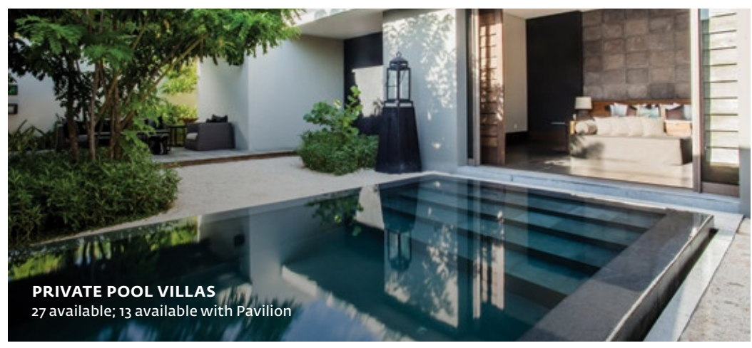
THE SIGNATURE SUITES AND VILLAS

274 luxurious suites and private villas on some of the most desirable beachfront property on the Yucatán Peninsula. These are divided amongst three areas of the resort, each area offering its own unique atmosphere.