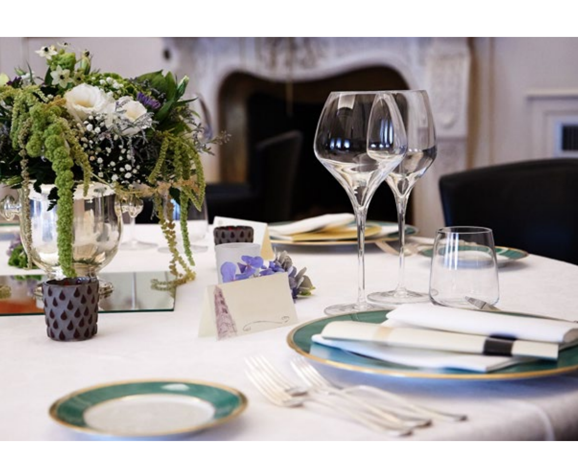
Weddings & Events