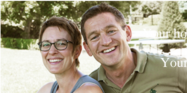
Your host couple & Your Chef