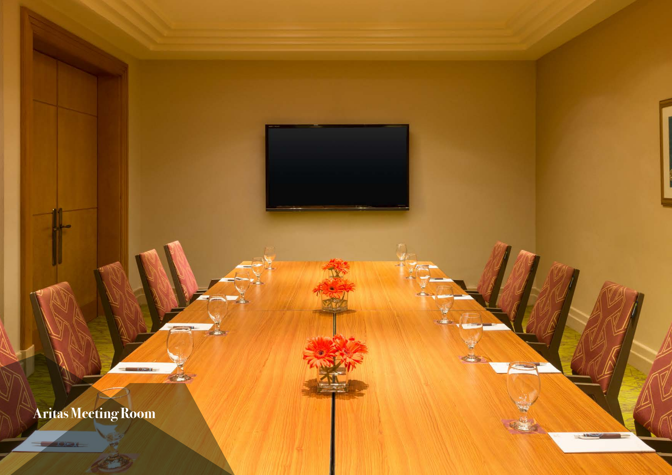
Aritas Meeting Room