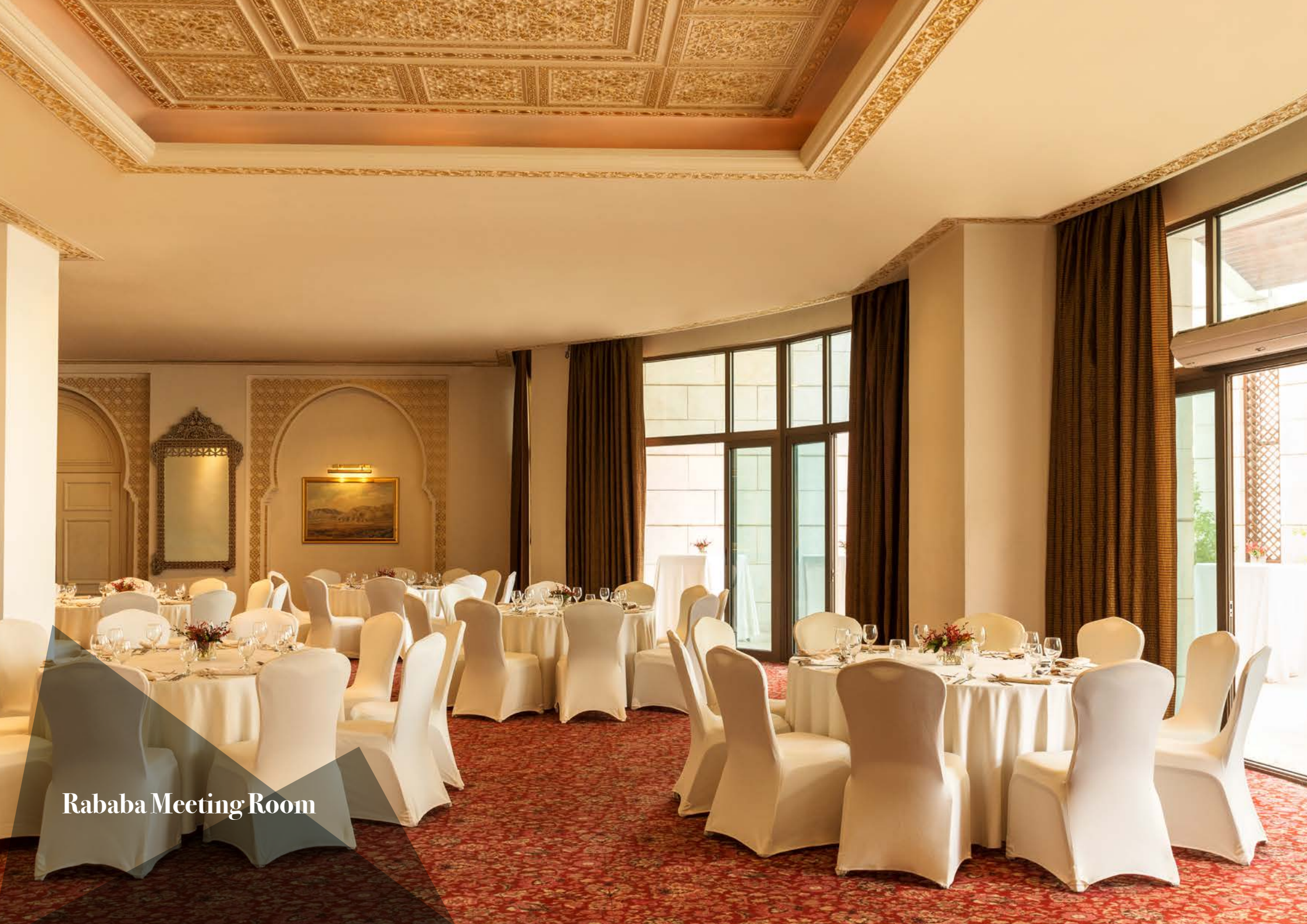
Rababa Meeting Room