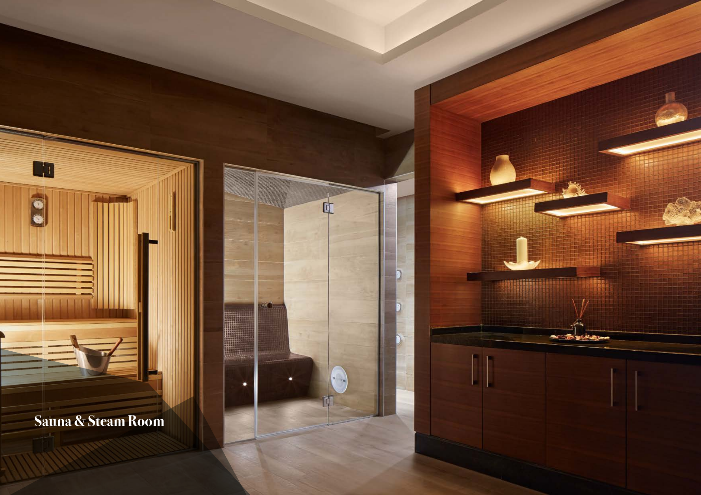
Sauna & Steam Room