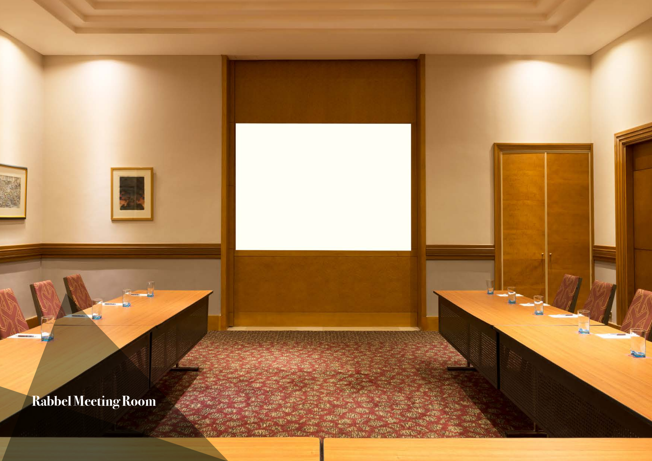
Rabbel Meeting Room