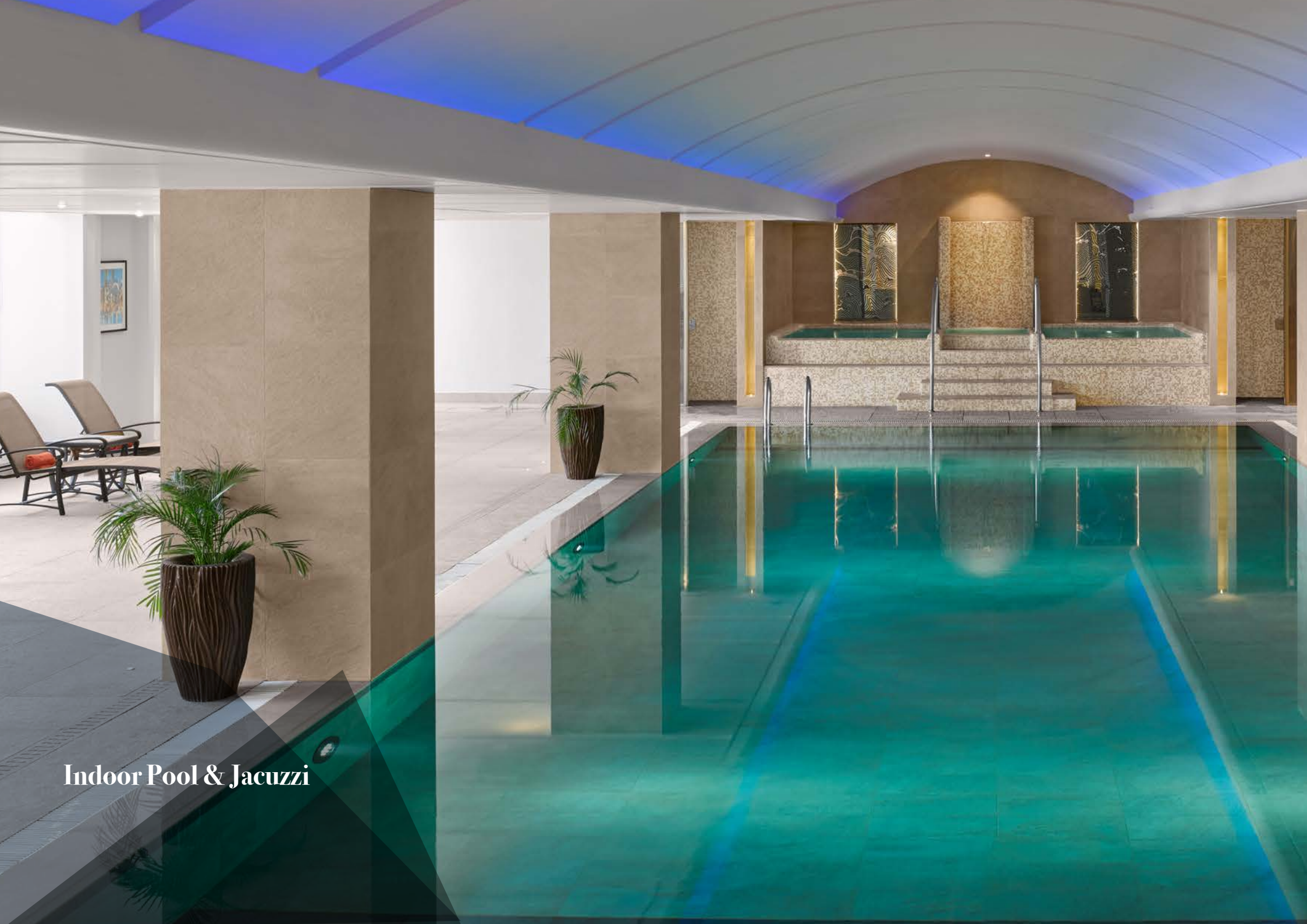
Indoor Pool & Jacuzzi