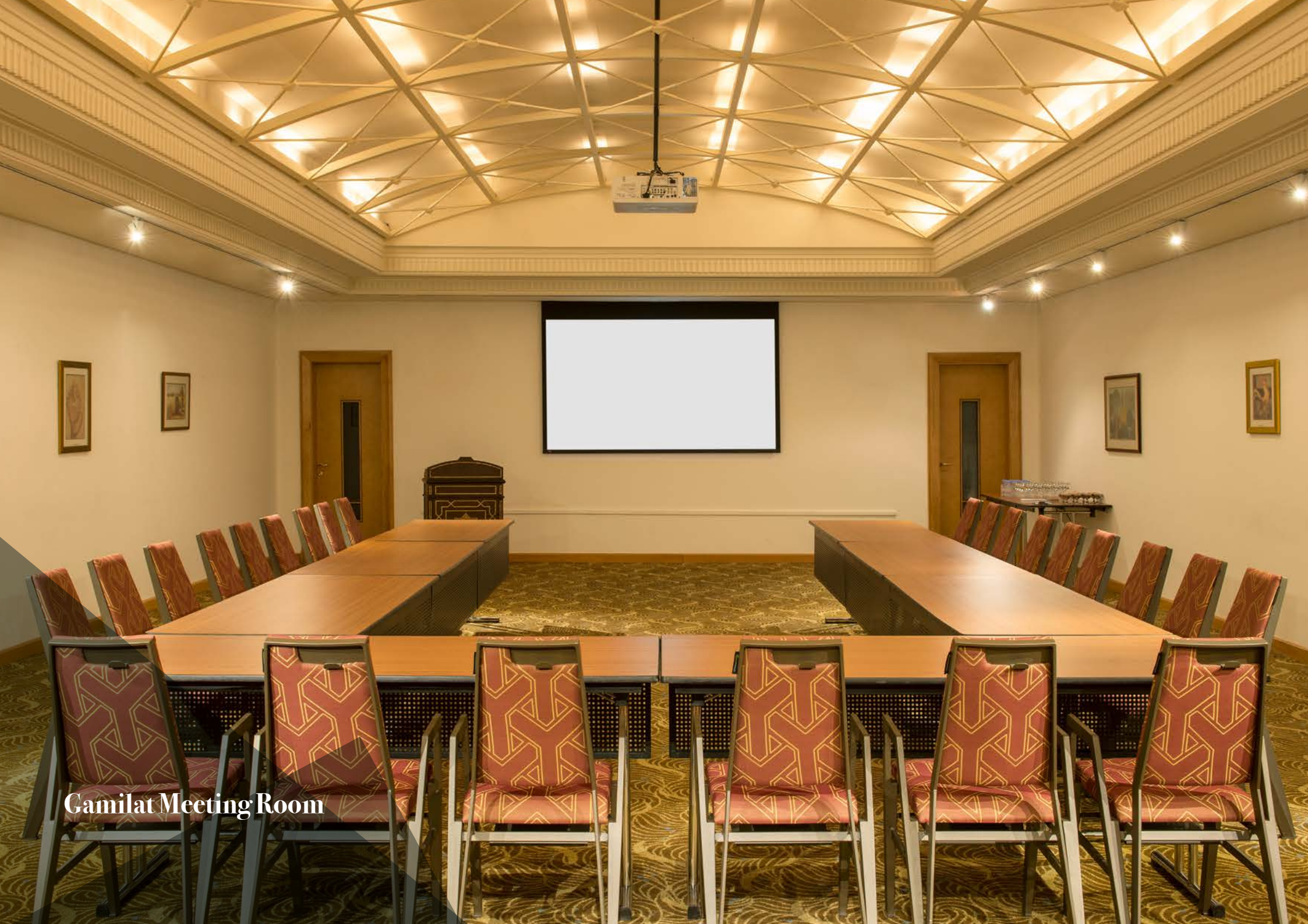
Gamilat Meeting Room