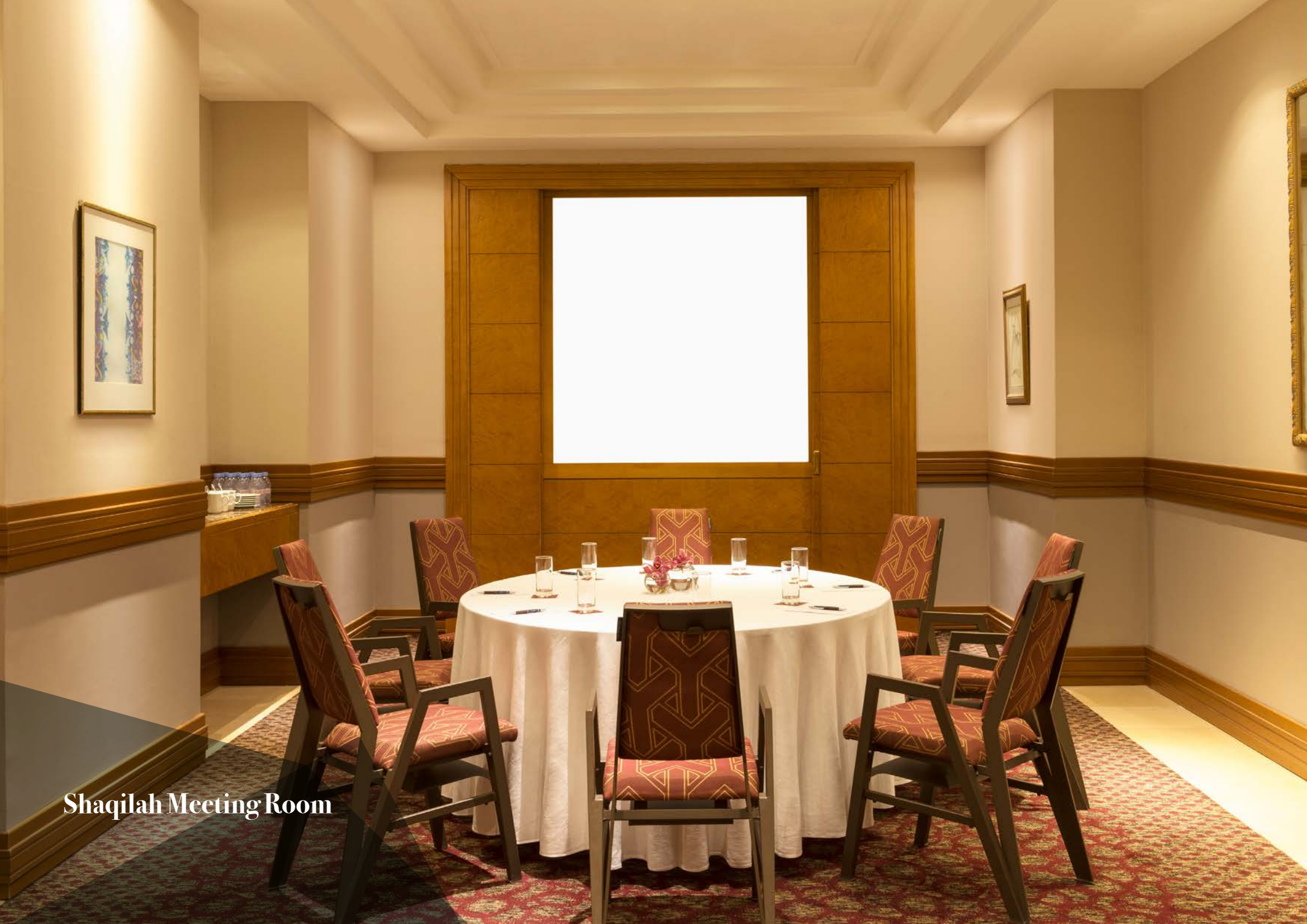
Shaqilah Meeting Room