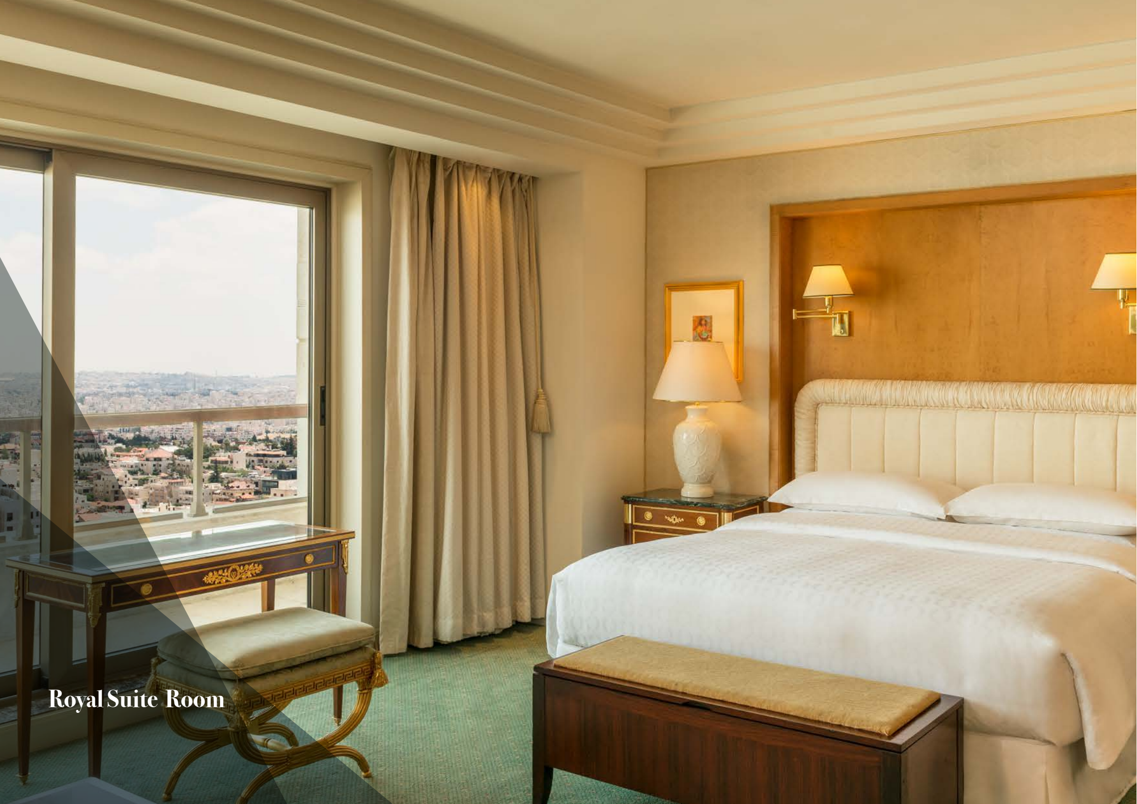
Royal Suite Room