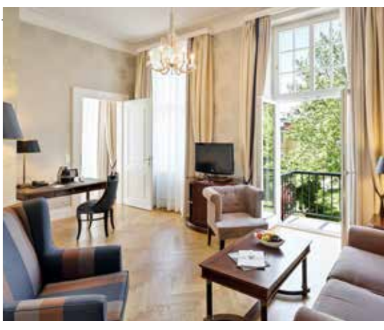
Free WiFi access in all rooms!