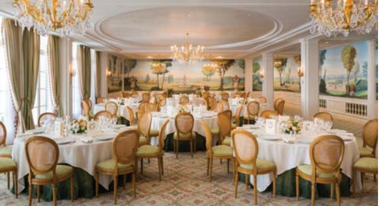
ABOVE: Salon Marigny, Salon Elysée and Salon Versaille LEFT: Salon Castellane