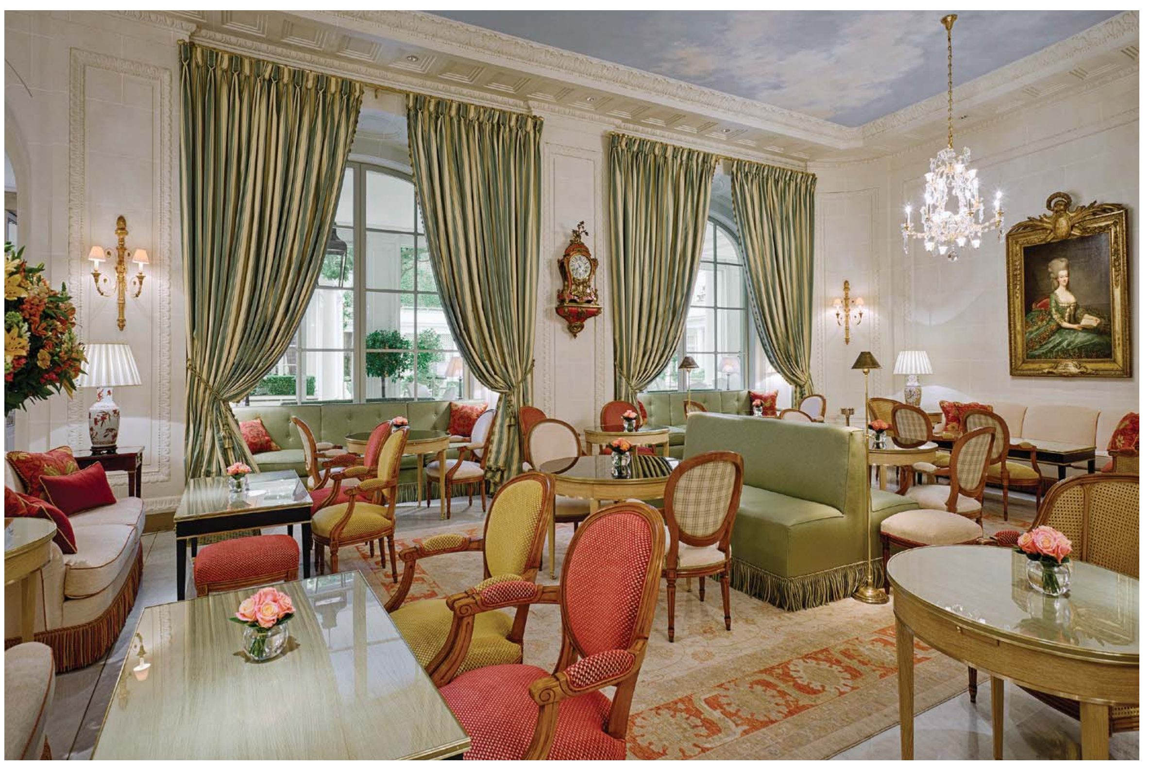
ABOVE: Le Jardin Français and Le 114 Faubourg RIGHT: Café Antonia